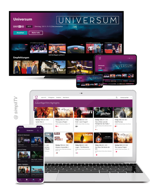
Flexible and location-independent television on laptops, smartphones and tablets with simpliTV streaming.