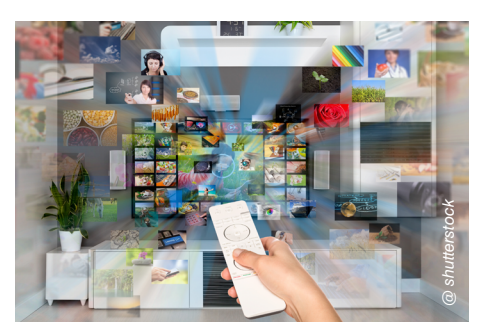
TV consumption in the digital age requires a modern content delivery network.

ORS not only brings the content providers' programming to linear TV channels, but also provides the hosting and playout platform, if desired. The content delivery network (CDN) can be organised using a wide variety of technologies such as overlay networks or multicast.