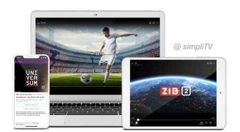
ORS provides comprehensive solutions in the area of streaming, ranging from signal acquisition to content playout.

Watch when and where you want – this is the claim that ORS fulfils with its innovative complete solutions for video streaming. Whether it's live streaming, time-shift, simplify catch-up TV or event streaming – the broad range of video streaming products from ORS allows TV audiences to access and consume moving image services flexibly, independent of time and place.