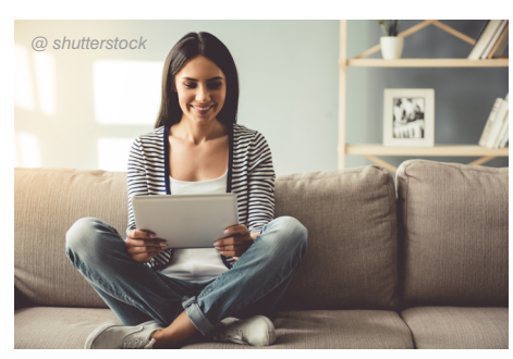
Whether it's live streaming, catch-up TV or event streaming – ORS has a wide range of video streaming products available