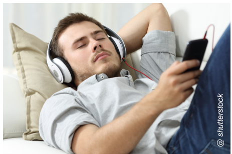
Radio streaming makes content available via the Internet

As with moving image content, radio stations can also be accessed via internet, and can therefore be consumed anytime and anyplace and are thus accessible to an even wider audience. Listeners can also hear radio programmes after their initial broadcast.