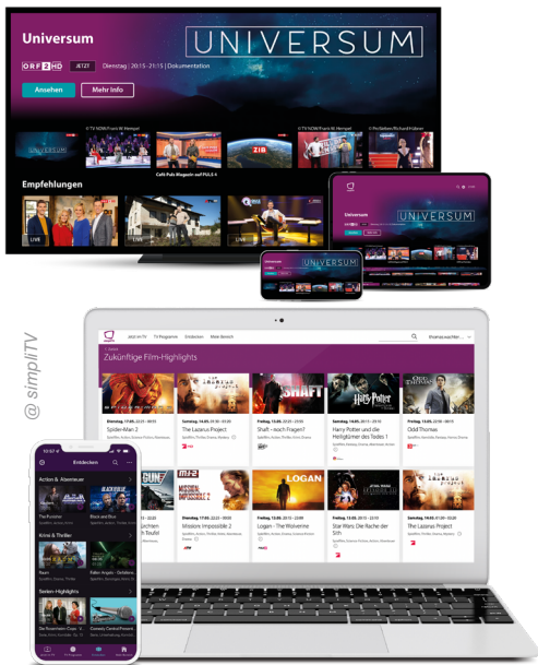
Flexible and location-independent television on laptops, smartphones and tablets with simpliTV streaming.