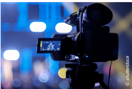
Stay in touch with your audience through live streaming, we take care of the processing.