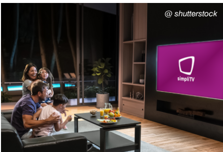
ORS provides easy access to antenna TV in HD quality with simpliTV via the nationwide ORS transmitter network.