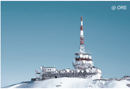
ORS operates nine modern large broadcasting centres throughout Austria. The picture shows the Patscherkofel/ Innsbruck transmitter.