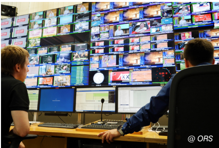
ORS maintains and services the nationwide transmitter network around the clock, seven days a week, even in the most adverse weather conditions.