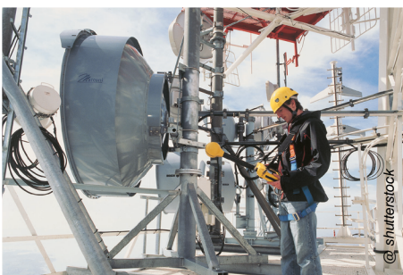
With approximately 430 transmitters, ORS operates a nationwide transmitter network for digital broadcasting TV transmission via aerial.